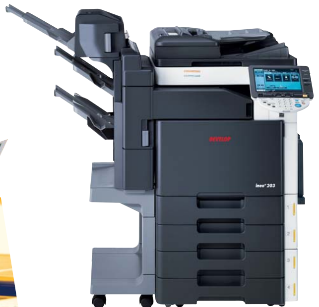
ineo+ 203 with document feeder (DF-611), embedded finisher (FS-519), saddle kit (SD-505) and 2x universal tray (PC-204)